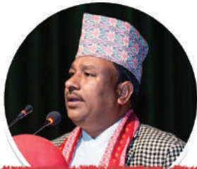
MR. JAGAT BAHADUR SUNAR Former Youth and Sports Minister