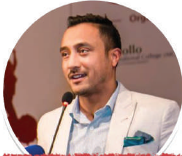
MR. PARAS KHADKA Former Cricket Captain