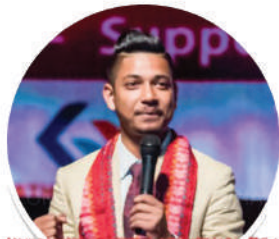
MR. SANDEEP LAMICHHANE Renowned Cricketer