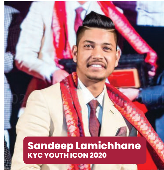
Sandeep Lamichhane KYC YOUTH ICON 2020

Apart from his individual achievements, Lamichhane has been actively involved in the development of cricket in Nepal. He has played a crucial role in inspiring and mentoring young cricketers in his home country.