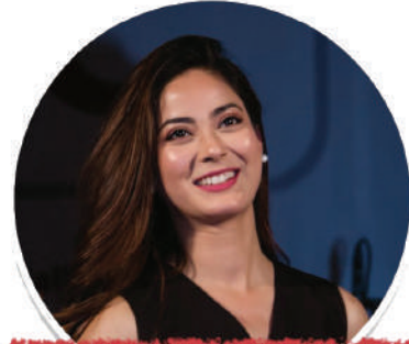
MS. SHRINKHALA KHATIWADA Miss Nepal 2018